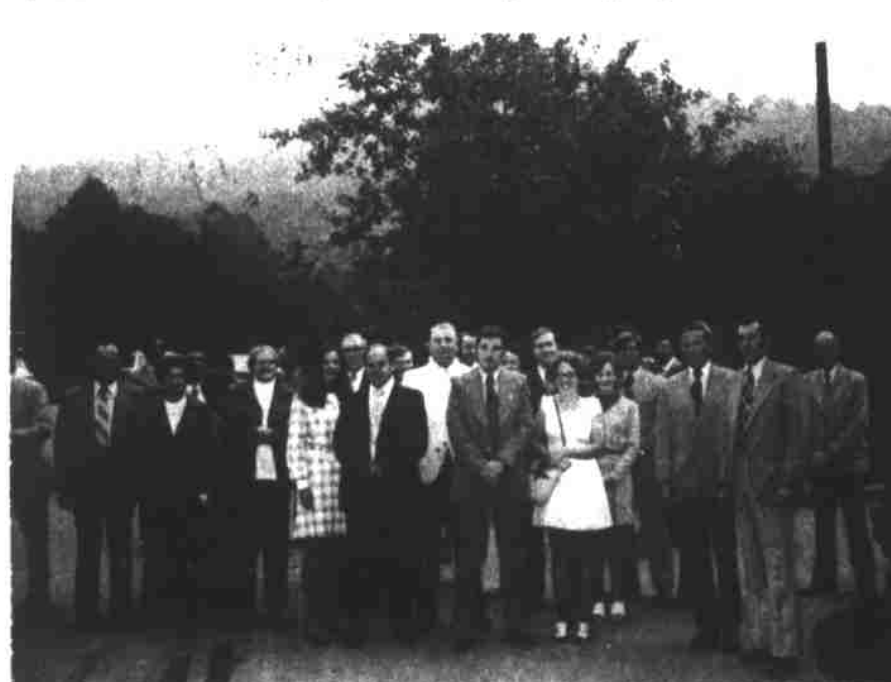
MARS HILL LIONS AND LIONESSES are pictured above just before enjoying a bountiful supper at Pisgah View Ranch at Installation ceremonie Tuesday night of last week.

Thirty Madison County 4-H'ers participated in District Activity Day Tuesday, June 25, in Franklin. Areas of participation were demonparticipation were demonstrations, archery, automotive skill driving, pork cookery and poultry barbecue, public speaking, and share the fun talent acts. County winners from 14 counties and the Charokee