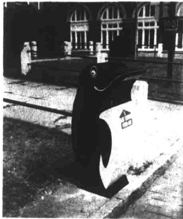
ATTRACTIVE LITTER CONTAINERS, such as pictured above, have been installed in several locations on Main Street here. The project was