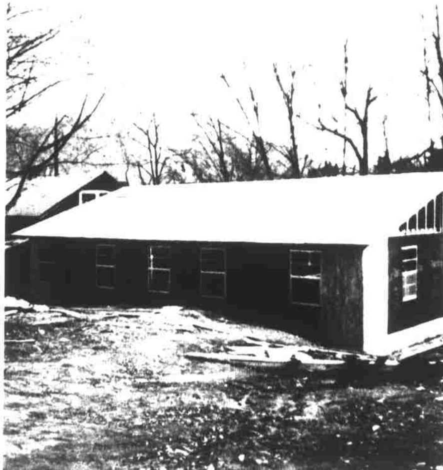
Camper's Cabin in Hot Springs nears completion.

Effective 31 December 1974 the present statute permitting a right turn on a red light will expire. However, since it has proven very satisfactory the Department will seek continuing legislation to the present law. The 1,860 signs that have been erected at intersections which prohibit a right turn on red will not be removed pending action by the Legislature.