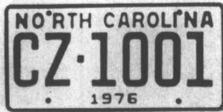
ANNUAL PLATE Issued for trucks, buses and special vehicle classifications.