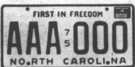
SEMI-PERMANENT PLATE Validated by sticker - applicable to private automobiles only.