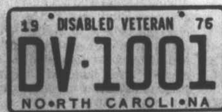
FREE DISABLED VETERAN PLATE Only 1971 series licensed Disabled Veterans eligible. Available at Raleigh Office Only.