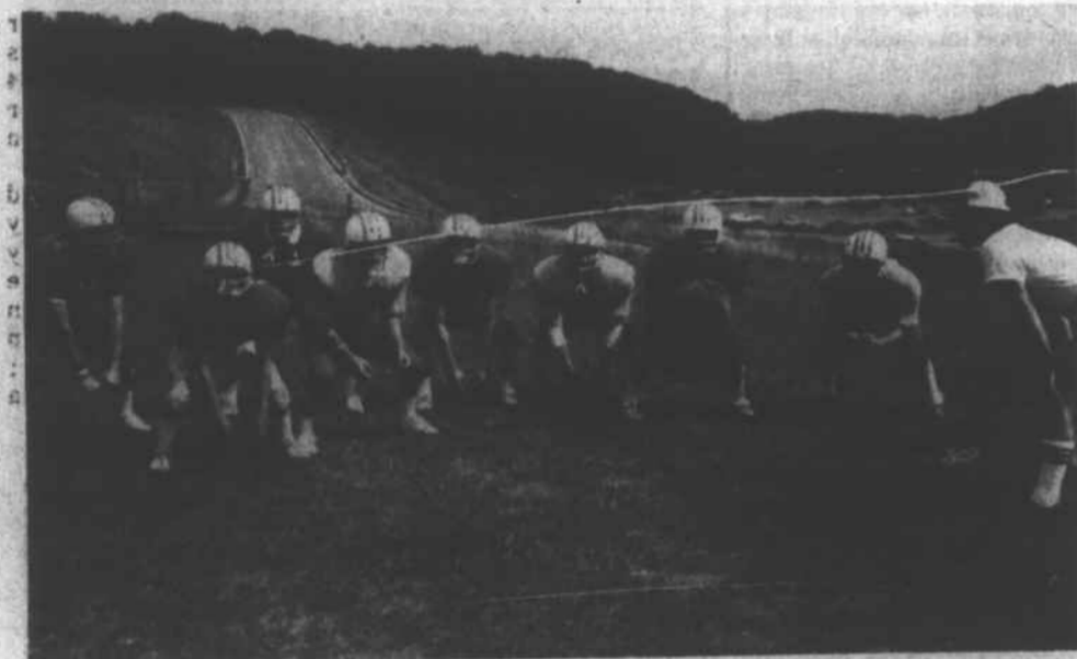
FORM TACKLING — Above pictures taken Monday afternoon show part of the Madison High School Patriots learning the techniques of form tackling as the squad got down to serious drills for the coming football season.