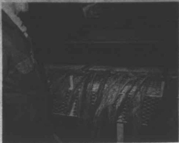
TOBACCO divided into three grades beginning trip through stripping machine.