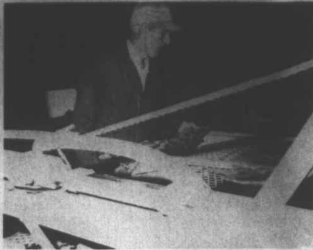
STRIPPED LEAF moving toward "handlers."