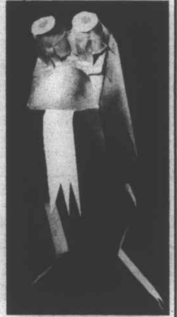
(Mix white glue with green tempera paint to make paint stick to milk carton.)