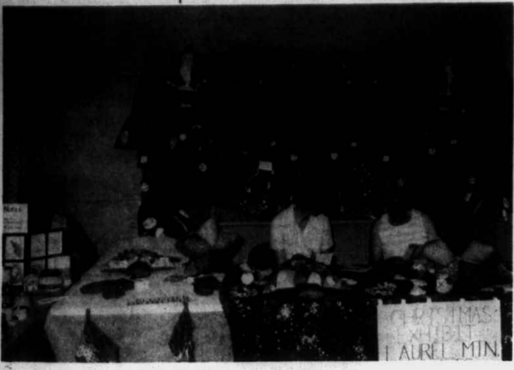
CHRISTMAS exhibit, colorful Crafts. display by Laurel Mountain