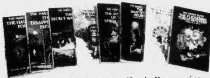
A few of the 56 titles in the Hardy Boys series