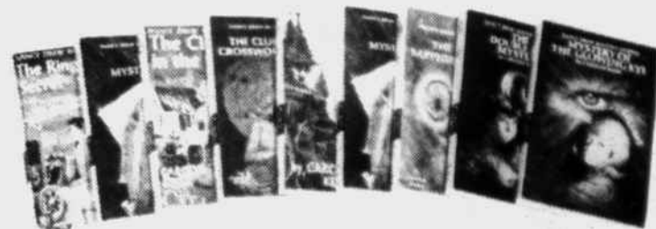
The Nancy Drew series has 54 titles