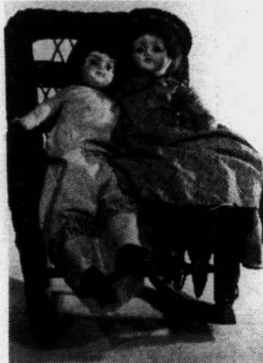
Doll photo courtesy Antique Doll Museum, Savannah, Ga.

Save your dolls, kids. They could be valuable.