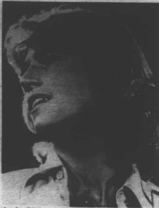
Andy Gibb—the youngest Gibb brother.

he was 12. One year later he began playing in a club.