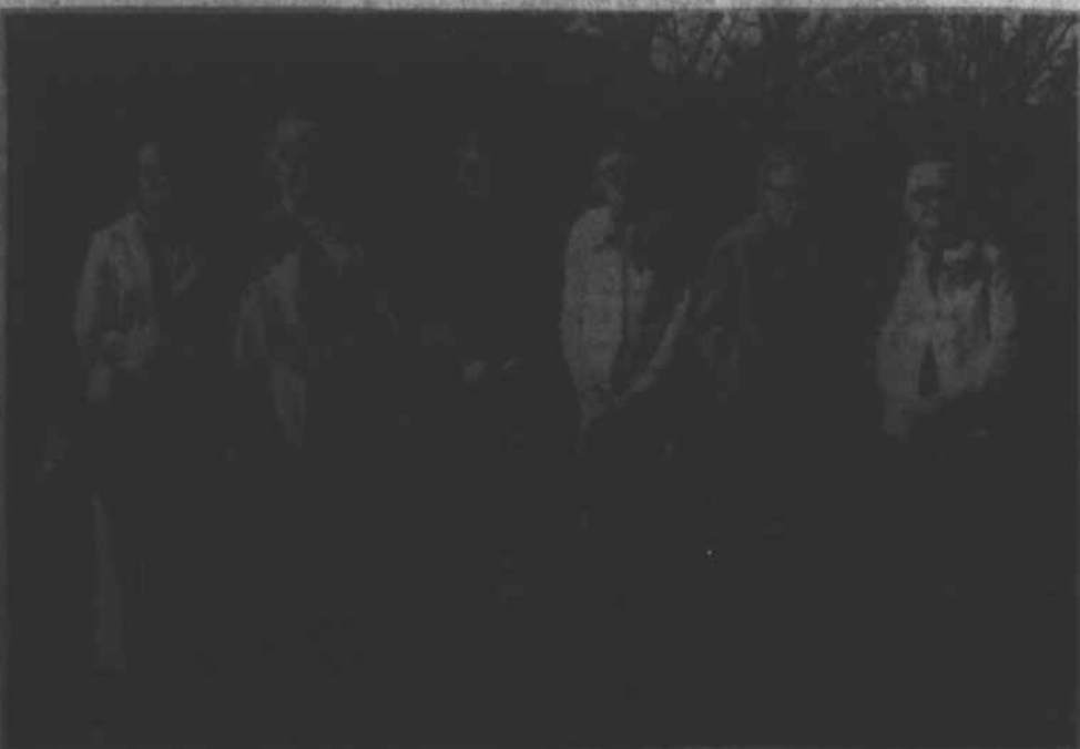
GOLD STAR MOTHERS — Shown above are six of the 18 Gold Star Mothers who rode in the Mars Hill Christmas Parade last Saturday. Left to right, Mrs.

Another group of delegates at the conference also visited the Greater Ivy Day Care Center.