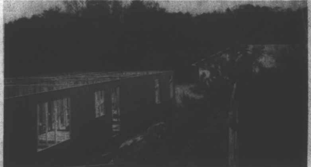
TWO PARTIALLY constructed rest homes (above) located in the Rector's Corner area near Marshall, are expected to be open by Jan. 1.