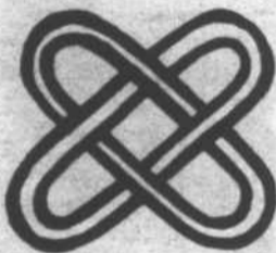
Dislike for bad habits