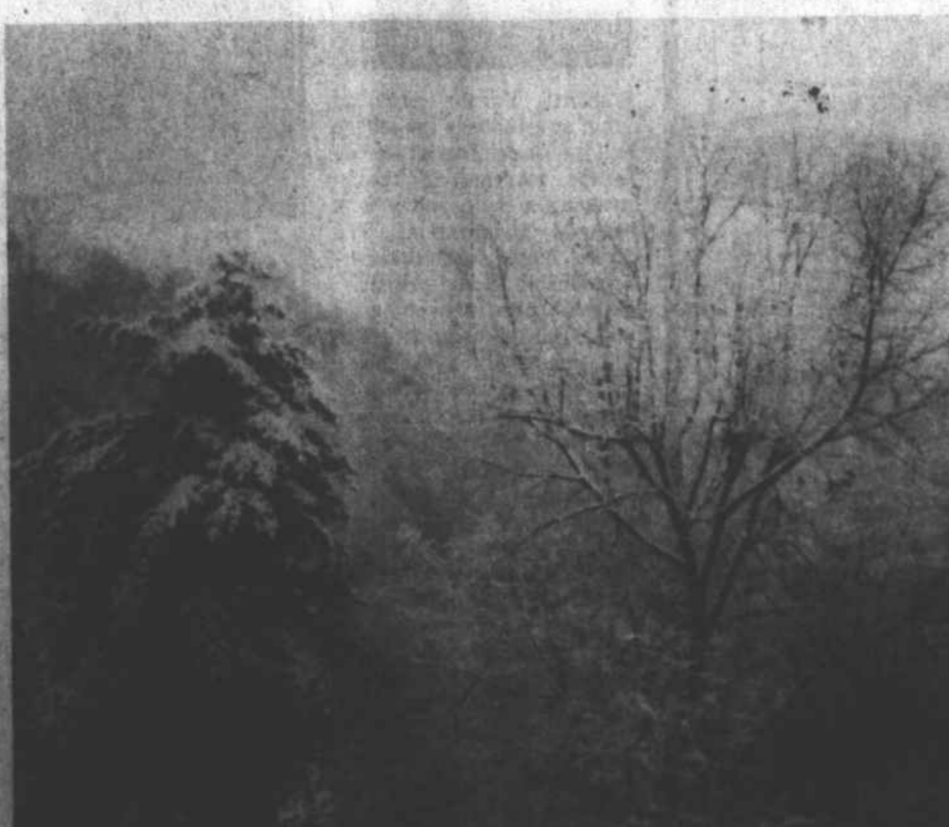
NOT THE DEEPEST, but perhaps the most beautiful snow of the year fell here Sunday night. Every branch and limb of trees were covered, and telephone and