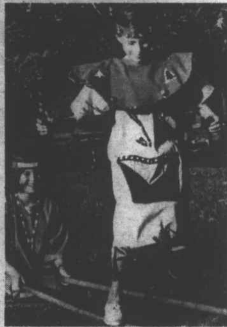
Camp Fire has costumes for special occasions. These are copied after the buckskins the Plains Indians wore.