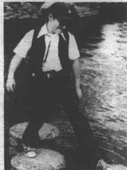
The usual costume for Blue Bird boys looks like this one. The costumes and Camp Fire colors are red, white and blue.