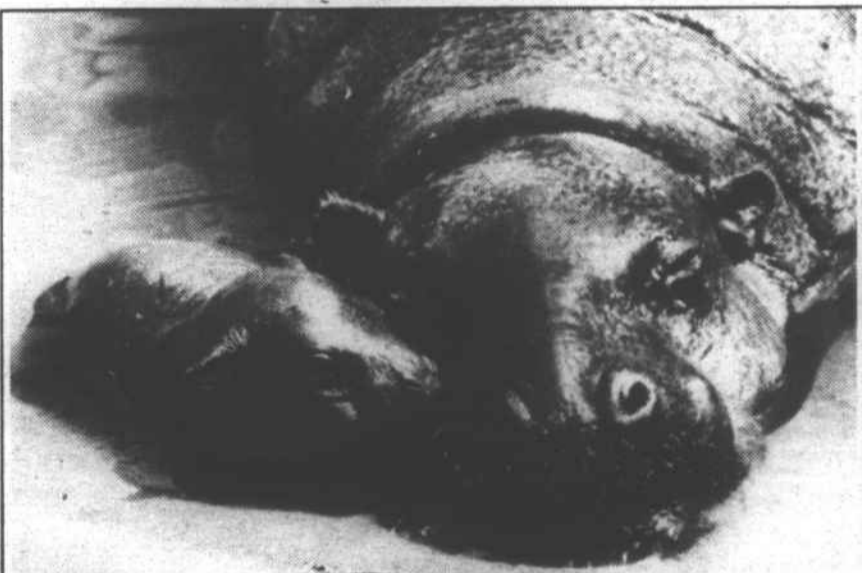
Baby pygmy hippo: "I was only 2 days old when this picture of Mom and me was taken. We like to stay in the water more than big hippos. We have to keep our skin wet or it cracks. Who wants rough, dry skin?"

SAN DIEGO, CALIF. — The San Diego Zoo is one of the best zoos in the country.