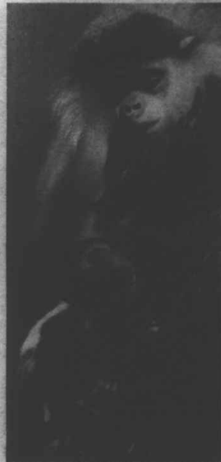
Baby Douc langur: "I have other females (or aunts) here in my monkey home who cuddle and groom me just as well as my mom. She doesn't mind at all. That's her in the picture."