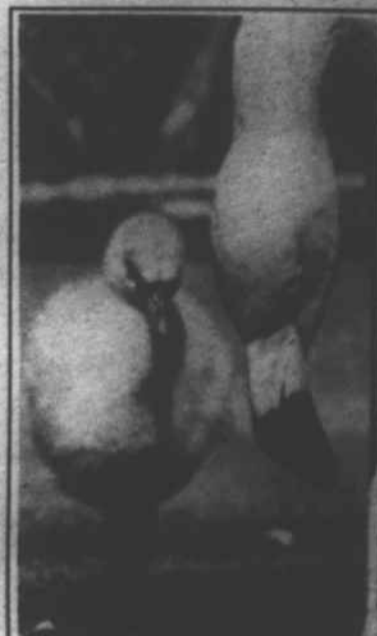
Baby flamingo: "My mom just has a single baby at a time. Dad helped sit on my egg."

To celebrate, we have some make-believe baby interviews.