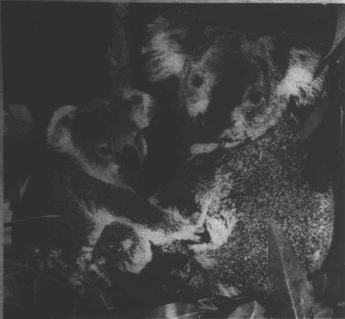
"Isn't this a good Mother's Day picture of Mom and me? I cling to her front or hang onto her back. I will stay with her for about a year. We are sitting in an eucalyptus tree. This is the only place we live because it has the only food we eat."

SAN DIEGO, CALIFORNIA — "Aren't I just adorable? Don't you just love koalas, especially babies?"