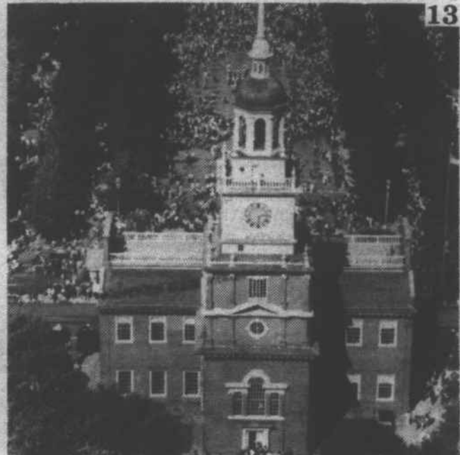
This building is in Philadelphia, Pa. During the Bicentennial in 1976, millions of people flocked to visit it.