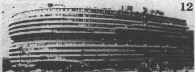
This building is in Washington, D.C. It is the site of the 1972 break-in of the Democratic Party headquarters that caused Nixon's downfall.