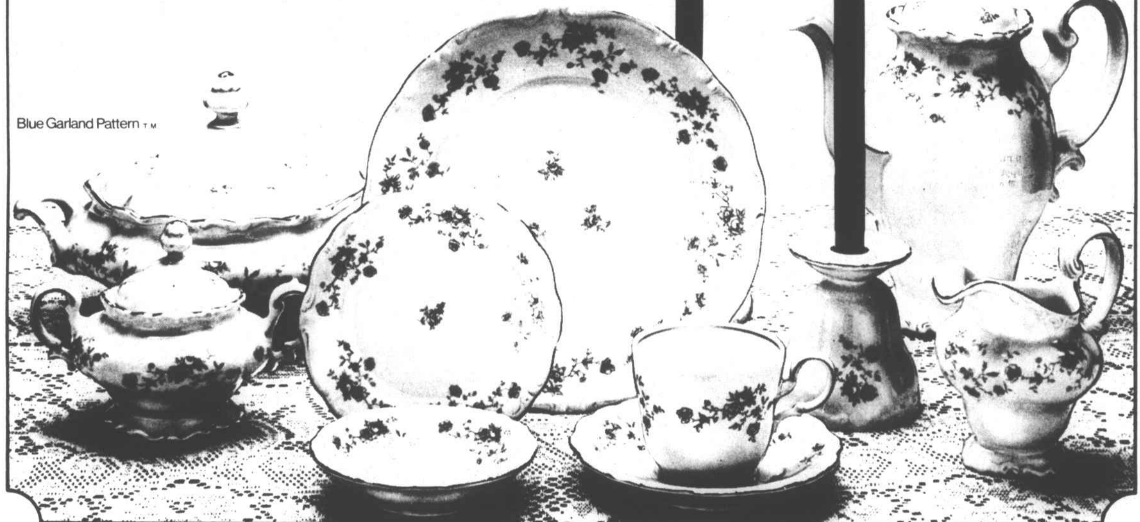
Blue Garland Pattern T.M.

Add Charm and Beauty to Your Table at a Price You Can Afford