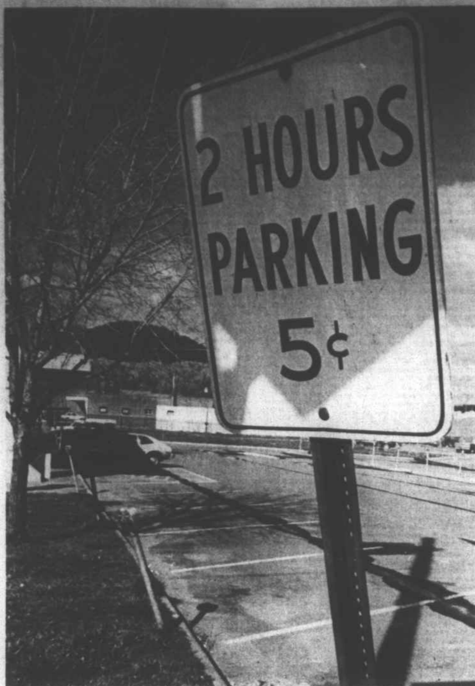
NICKEL DOESN'T BUY MUCH Building, but not many were taking advantage of the bargain when the photo was made. two hours of parking in the lot next to Canton Municipal

You should tell her and everyone else involved what you have done. This won't be easy and she may never be your best friend again, but you will feel better about this situation. I also think you have learned a valuable lesson here and won't do anything like this again.