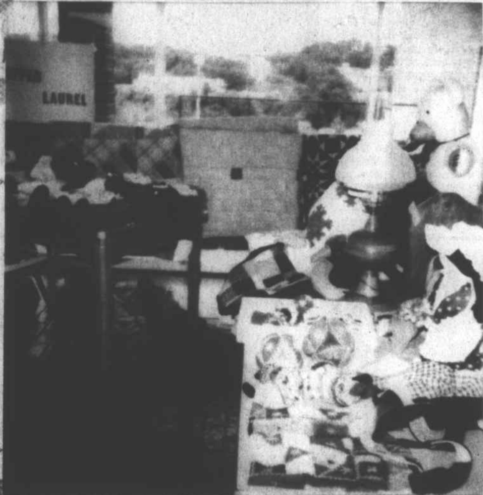
DISPLAY of crafts made by individuals from various areas in Madison County shown at Senior Citizens Day.