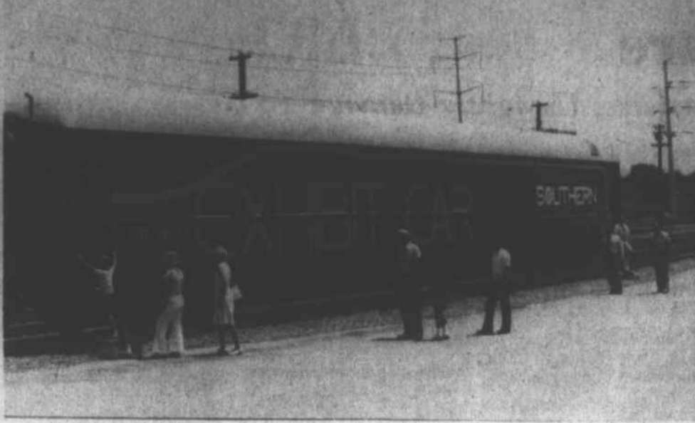
SOUTHERN RAILWAY'S Exhibit Car is a rolling museum filled with photos, models, and slide presentations to tell the public the story of modern railroading.

The Hot Springs Lions Club would like to thank everyone for the support shown at the July Fourth celebration in Hot Springs and during the past year. Your future support will be appreciated.