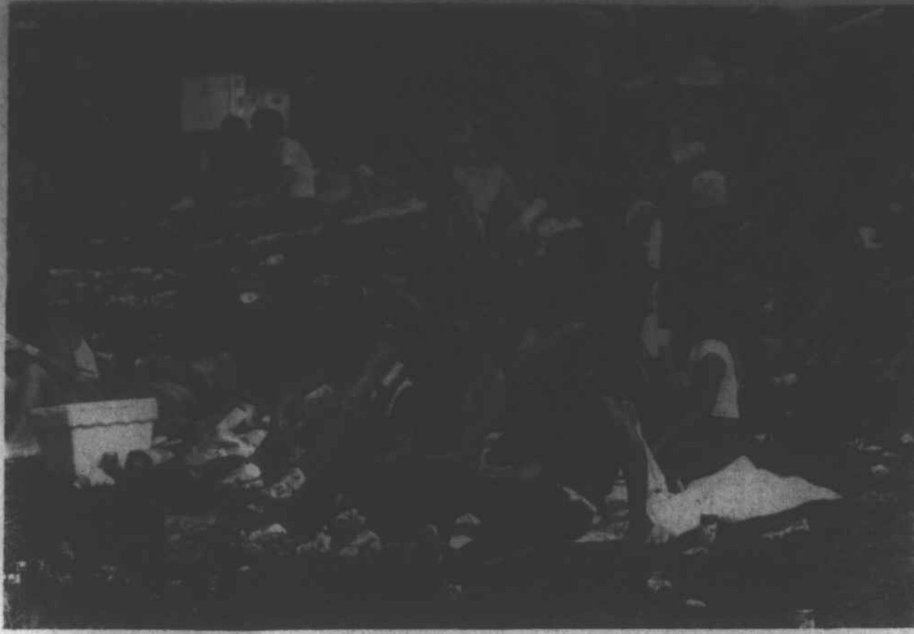
Rock Fans Ignored Sunday's Heat At The Benefit Festival