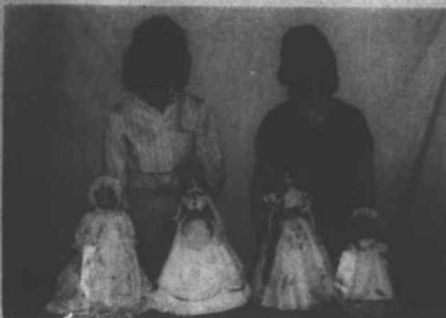
PRIZE-WINNING 'Scarlett O'Hara' dolls are displayed in New York.

The News Record is available in Marshall at Roberts Pharmacy on Main Street.