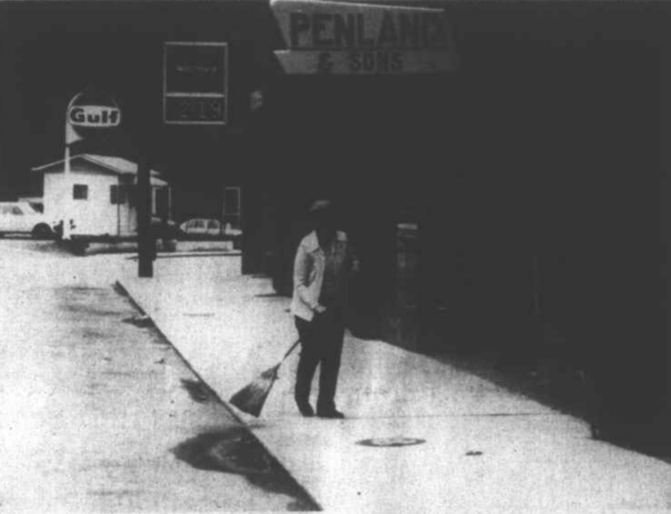
SCENES LIKE THIS ONE should be repeated throughout the county next week as the annual Spring Cleanup campaign gets underway.

The board also heard a proposal to install new insulated windows in the county court house, but took no action.