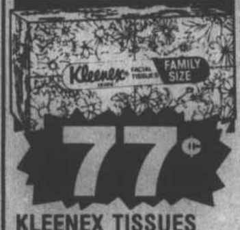
KLEENEX TISSUES Regularly 99°. 250 ct. 2 ply facial tissues. Limit 3.

QUAKER STATE OIL Regularly 1.03. Regular 30 or HD 30 motor oil.