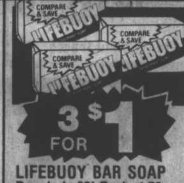
Regularly 39' Each. 4.75 oz. bars of Lifebuoy. Limit 6.

QUAKER STATE OIL Regularly 1.03. Regular 30 or HD 30 motor oil.