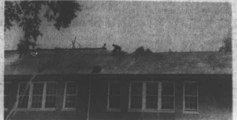
WORKERS REPLACE 59-YEAR OLD ROOF on Marshall Elementary School last week. Passage of additional half-cent sales tax will make other improvements to county schools possible.

An estimate prepared by the North Carolina School Board Association states that Madison County will receive some $450,950 in revenues during the first year the additional half-cent is collected. The Madison County Board of Education cur-