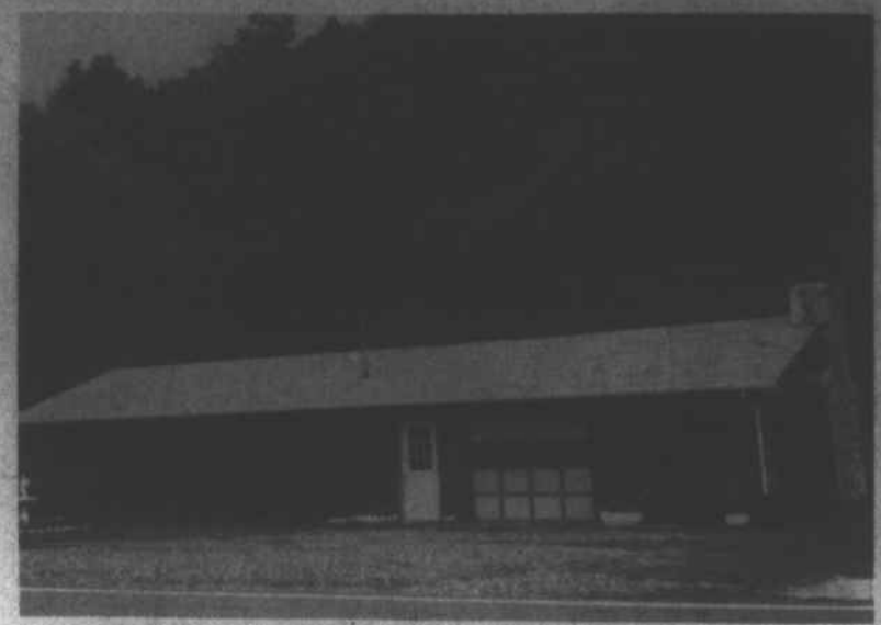
New parsonage finished by church members

The community would like to recognize other members who helped clean up the roadsides, worked at the center, planted flowers and made efforts to help improve the community.