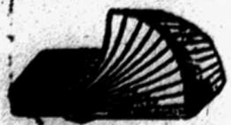
Big Values in Felt Mattresses