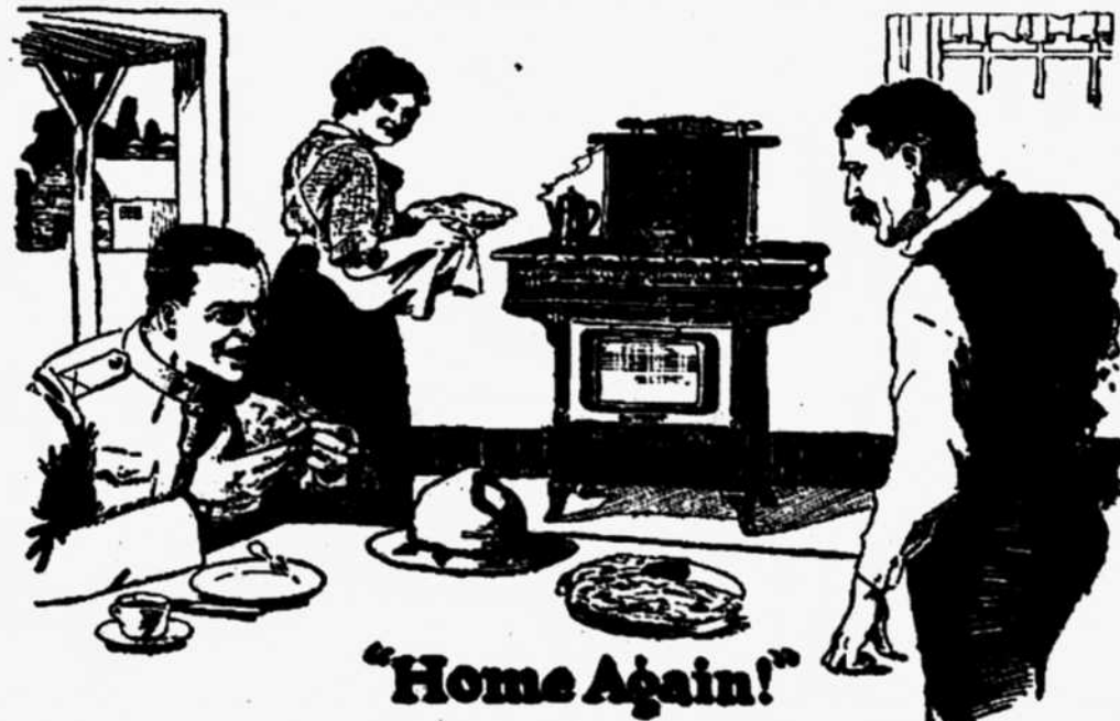
DETROIT VAPOR-Wickless, Kerosene-burning, Cook Stove. Best on Earth—While Present Stock Lasts.....$78

Butler Brothers will be delighted to show you their store. They want you to go through its four great floors filled with the best goods they have been able to pick from the markets of the world. Even if you do not want to buy now, you will enjoy seeing the store. You can find it easily. It is the big red brick building at the corner of Broad and Wilson.