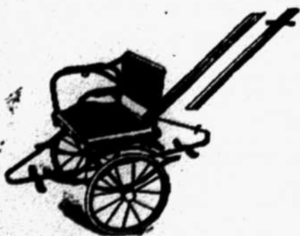
Pull Carts .....$16.50 to $35.00