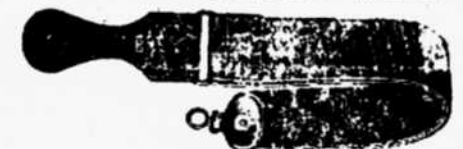
Pike Razor Straps $1.50 to $2.25