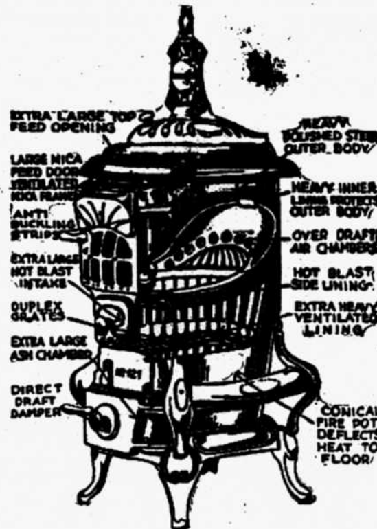
HOT BLAST HEATER

We are showing here a few of our standard goods. Of course you know that these are only a very small part of our big stock. Their prices are some higher than they were two years ago, but still they are priced at figures much lower than many dealers are charging and lower than we will be obliged to charge when the present stock is exhausted.