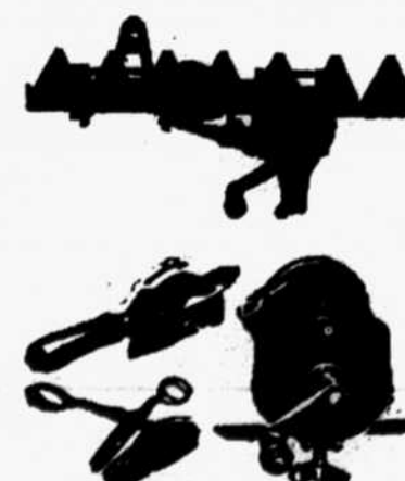
Best on Market Priced from $4.00 to $8.00