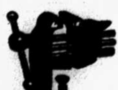
Vises .....$1.50 to $4.50

Your visit to Dunn will not be complete if you fail to visit us. Our store is one of the town's show places. It will be a genuine delight to us to be permitted to show you all over it. We will welcome you, whether you come to buy or just to look. Our salesmen want to see you—Don't disappoint them.