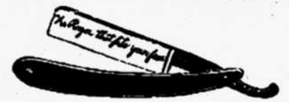
Shur Edge Razors $3.50 to $4.00