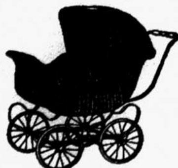
Baby Carriages .....$50 to $85