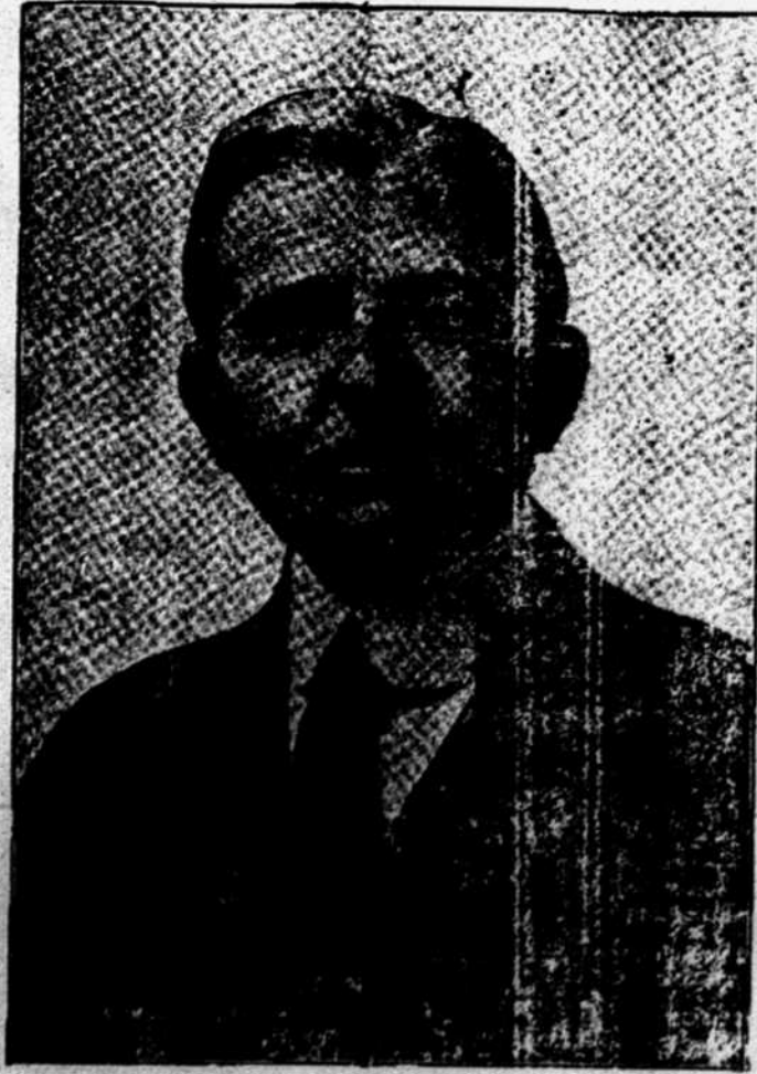
HON. CAMERON MORRISSON (Leading in the Contest for Governor.)