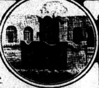
FOUNTAIN PLAYS IN CENTER OF COURT BETWEEN TWO INFIRMARIES