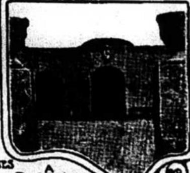
RECREATION PATIO BETWEEN MEN'S AND WOMAN'S INFIRMARIES