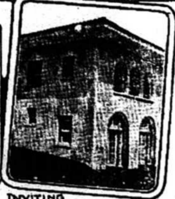
INVITING CORNER OF MEN'S INFIRMARY