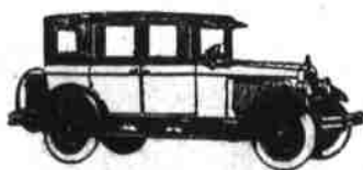
The car illustrated here is the De Luxe Sedan, priced at $1115, at Lansing.

You can depend upon a car built like that. You can recognize the difference the moment you take the wheel. The more you drive the Oldsmobile, the more you will appreciate these exacting standards. For they guard that fine performance steadily, as months and miles roll by.