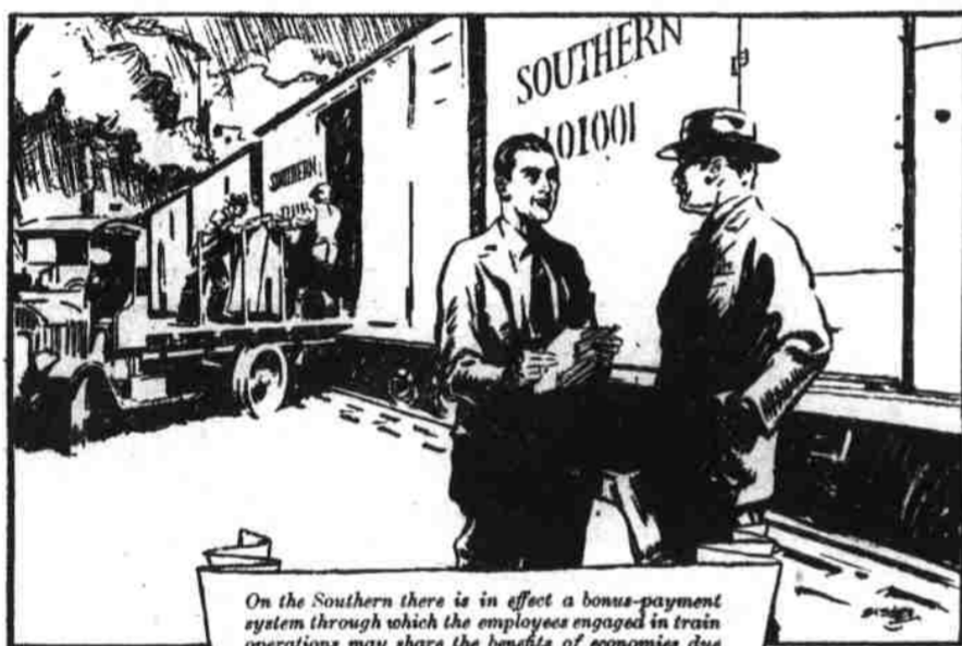
On the Southern there is in effect a bonus-payment system through which the employees engaged in train operations may share the benefits of economies due to their efforts.