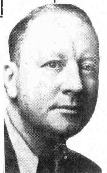
ROBERT R. REYNOLDS For United States Senate