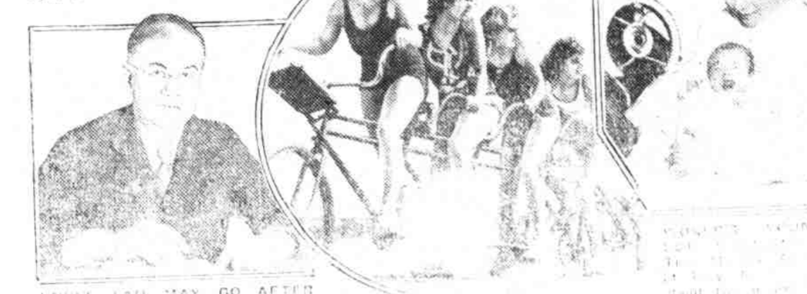
UNCLE SAM MAY GO AFTER GASOLINE TAX EVADERS. The State Government is out for the tax evaders...