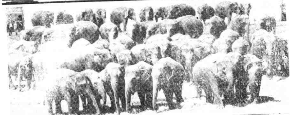
THE LARGEST GROUP of performing elephants ever assembled. These fifty giants are presented this year by the Ringling Bros and Barnum & Bailey combined circus...