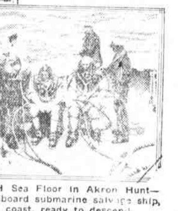
SEARCH Sea Floor in Akron Hunt—Divers aboard submarine salvaged ship, off N. J. coast, ready to descend.

JUST A COUPLE OF GAY DOGS—Teaming at the mouth! At last the lowly (in more ways than one) Dachsund has come into his own!