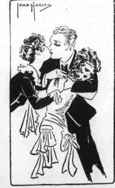
"A chap who embraces every oppor-