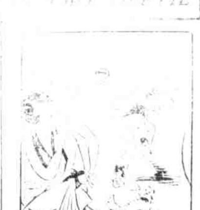
Funny, how a lazy setter enjoys going for a tramp."