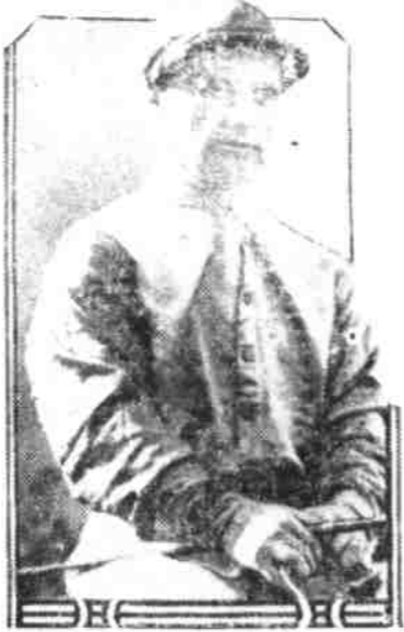
Gordon Richards, England's leading jockey, wound up the season there with 27 winners, which established a new record for England if not for the world.