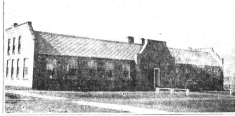
This building is the headquarters quarters at the state prison camp at Hazelwood which is now the "home" of men serving long sentences.