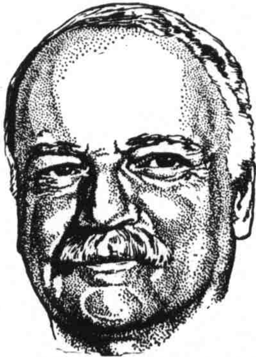
Former Vice President, Charles Curtis, under Herbert Hoover, passed away at his Washington Hotel last Saturday morning, following a heart attack. He had been indisposed for several weeks.