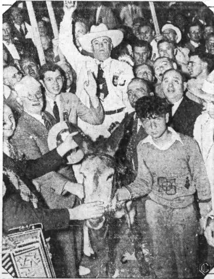
One of the events which typified the carnival spirit of the Democratic national convention at Philadelphia was the appearance of a somewhat frightened but tractable donkey, representing in realistic fashion the symbol of the national party.