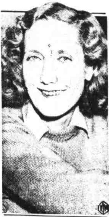
Mrs. Beryl Markham

Despite a bump on her forehead received when she made a forced landing in a Nova Scotia marsh, Mrs. Beryl Markham was all smiles when she arrived in New York, above, after flying the Atlantic from her native England.