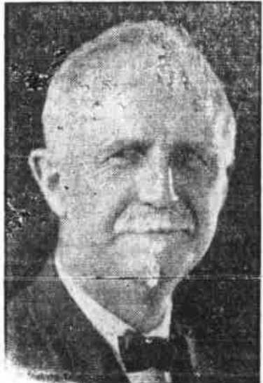
Roger W. Babson