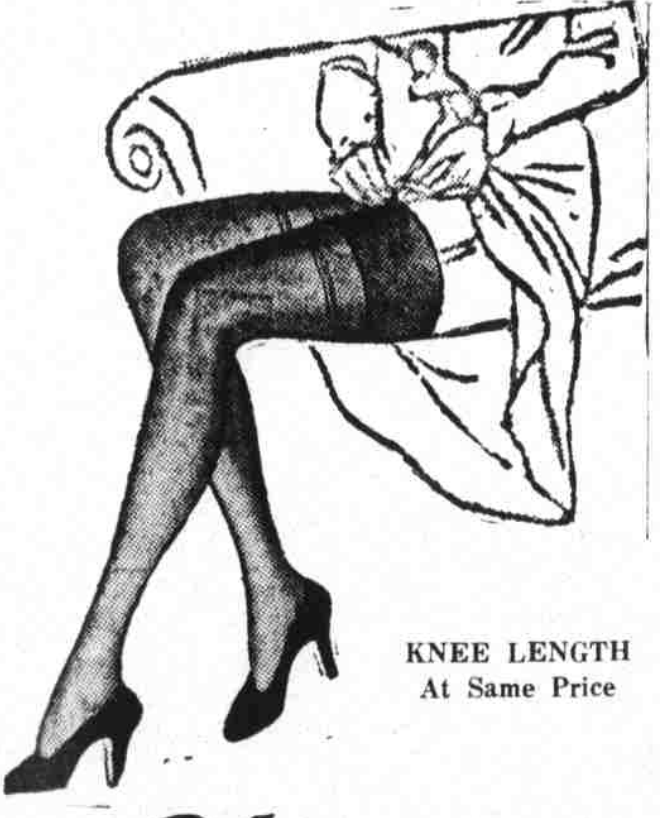
KNEE LENGTH At Same Price