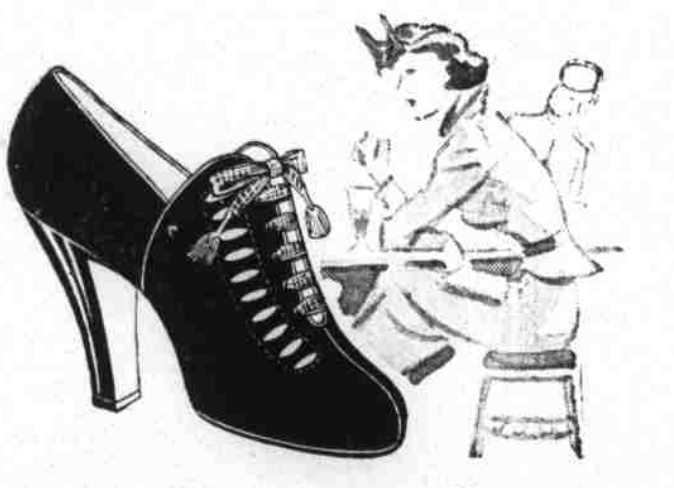
Harold's Dept Store "HAYWOOD'S BARGAIN CENTER"