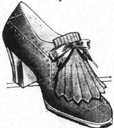
Brown Suede Oxford

Brown Suede with Brown Kid Piping | Black Suede with Black Kid Trim.