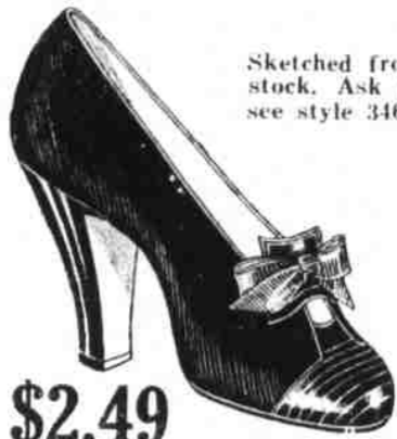
Sketched from stock. Ask to see style 346.