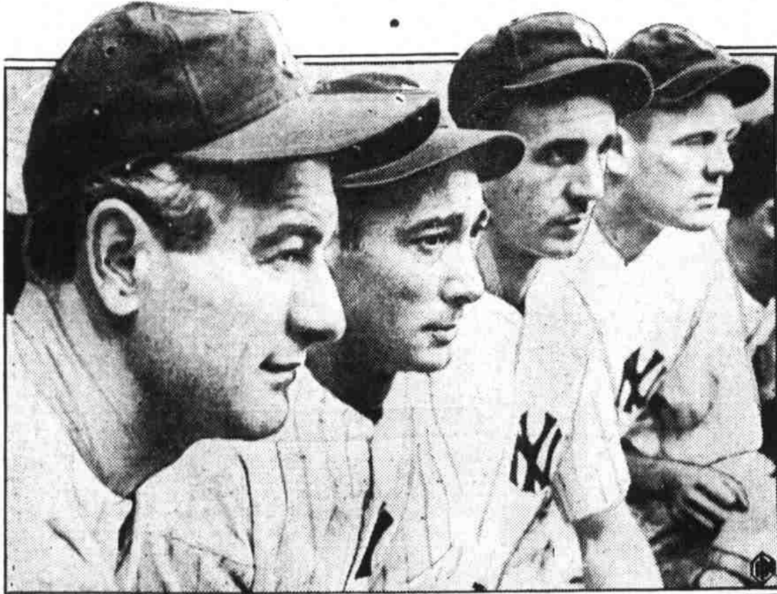
Lou Gehrig, Tony Lazzeri, Frank Crosetti and Red Rolfe

You're looking at the New York Yankees in field. The quartet of brilliant fielders and hitters consists of, left to right, Lou Gehrig, Tony Lazzeri, Frank Crosetti and Red Rolfe.