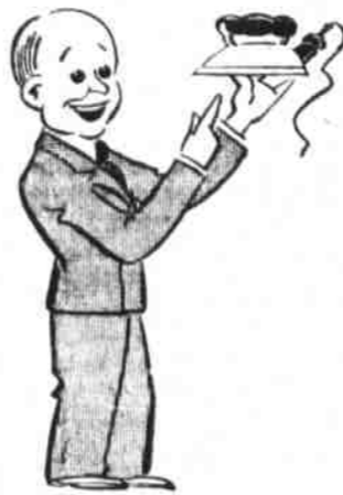
Your Commissioner of Happiness

The ironing for the entire family can be quickly and easily done with a new AUTOMATIC ELECTRIC IRON . . . thousands of homemakers are delighted with this MODERN WAY!